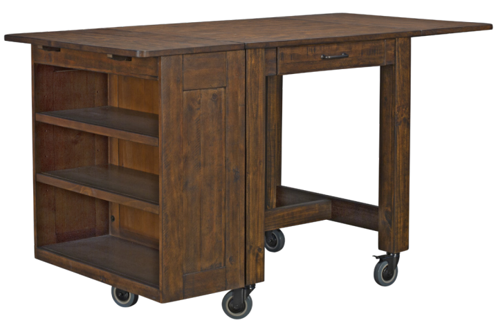
ABE-RT-9-01-0 OPEN SHELF UNIT 30"W x 35"H x 13"D